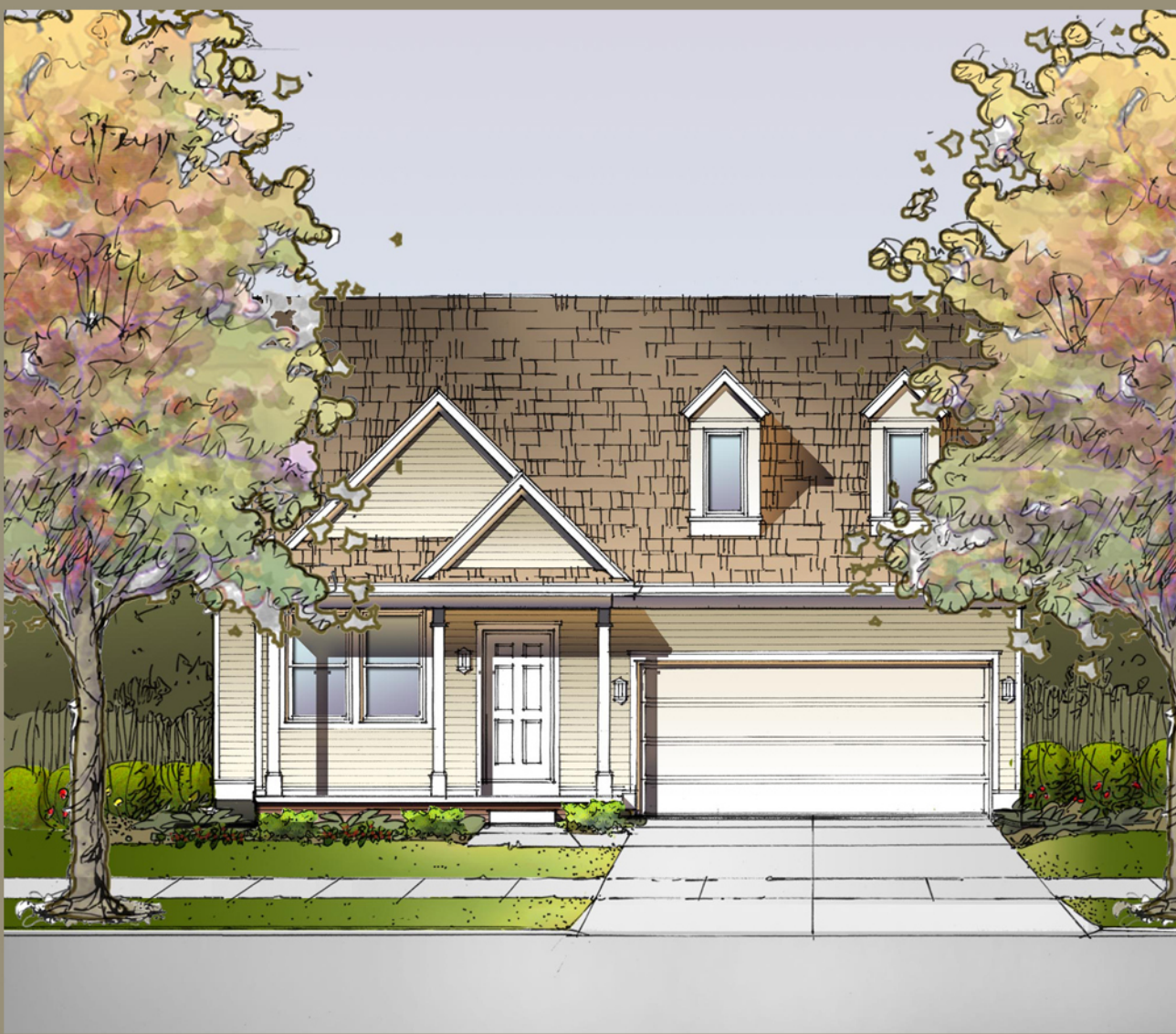
ELEVATION B WITH SIDING