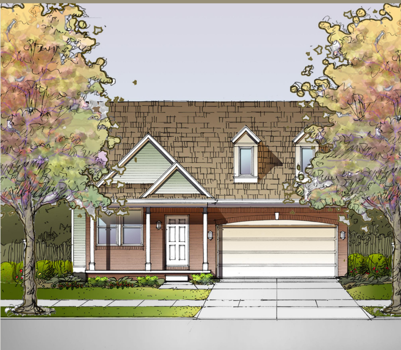
ELEVATION B WITH BRICK